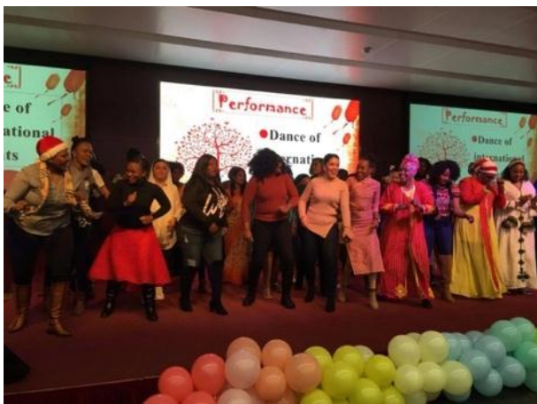
New Year Party

An International Master degree of Social Work (IMSW) will be conferred upon a candidate after her successful completion of required credits and her thesis approved by the University Academic Committee.