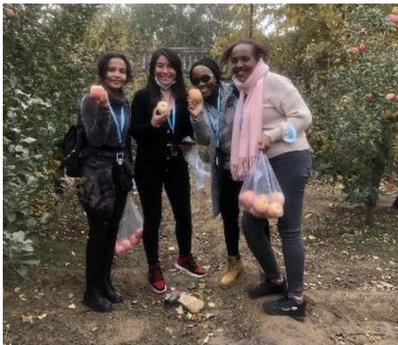
Picking up a Piece of Autumn

Instructors will be assigned to students to provide guidance and advices for their study.