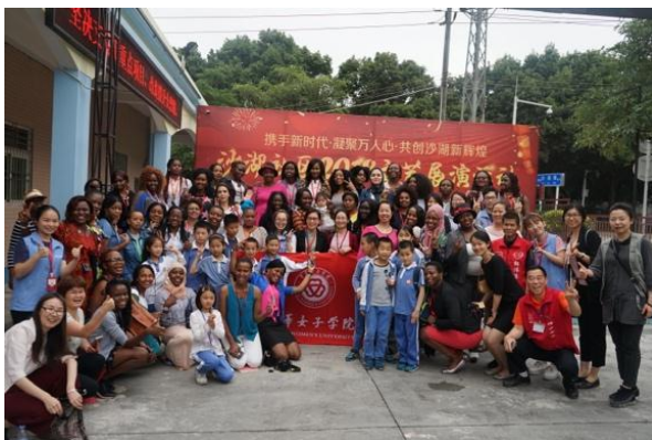
Fieldwork in Social Work Association

Ph.D., Professor of Social Work, former Chairperson of University Council of China Women's University, specialized in Gender Studies and family.