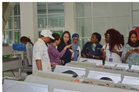
Fieldwork in Tea's Factory