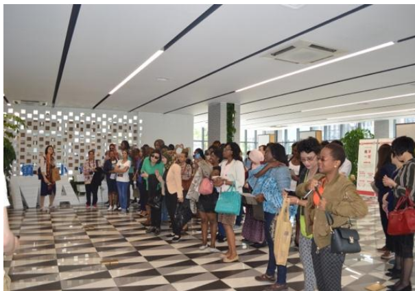
Fieldwork in Hangzhou Future City

Ph.D., Professor of Sociology, President of China Women's University, specialized in international communication, media and Women's Studies.