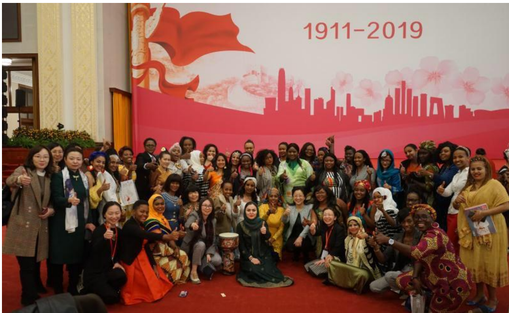
Reception of International Women's Day, Great Hall of the People

Ph.D., Professor of Law, Vice President of China Women's University. specialized in women's property rights protection, civil law, women's law.