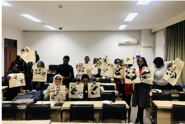
Experience Chinese Culture

Each academic year starts from September and ends in July. Thus, the two-year program includes 2 full autumn semesters, 2 full spring semesters, two winter vacations and 1 summer vacation.