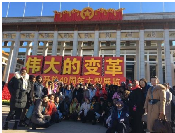
Understanding Chinese Experience

The courses' emphasis is laid upon applying interdisciplinary theories and multi perspectives of researching methods into practice, and let the students have a deeper understanding of gender and social development, women's leadership, as well as the theory and methods of women's participation in social development. The courses also aim at actively exploring the political and social factors hindering women from governance and decision-making. Theoretical studies will be combined with fieldwork and practices to effectively enable the students to better participate in government decision-making and governance. Students graduated from this program will possess both broad academic vision and solid professional basis to enhance their leadership capability, their ability to participate in government decision-making, as well as to advocate and encourage women's participation in social development in their home countries.