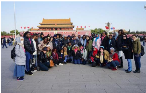
Tian An Men Square - The Heart of China

Professor of Law, Chairman of University Council of China Women's University, specialized in family inheritance law, women's human rights, women's law, civil law, etc.