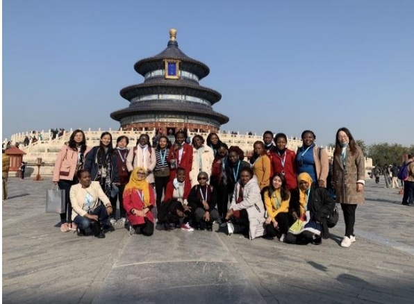
Visiting the Temple of Heaven

Teaching language is English. Classroom teaching will be the main teaching method, while incorporate a mix of lectures, seminars, case discussions, as well as practices inside and outside the classrooms.